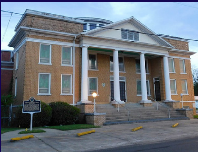
Tabernacle Baptist Church, Selma, Dallas County

Tabernacle Baptist Church is the only church in Alabama to be included in the grant. It was originally built in 1922. The church was listed in 1996 on the Alabama Register of Historic Places and was also listed on the National Register of Historic Places in 2013. An Alabama Historical Commission historical marker is placed out front so visitors can read and understand the importance of this church in the community.