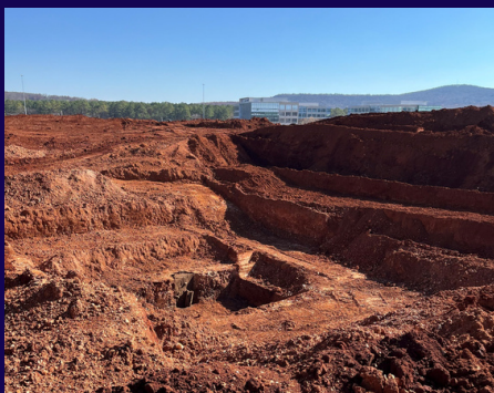
A view of the excavation site.