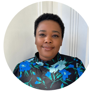
Jada Jones Preservation